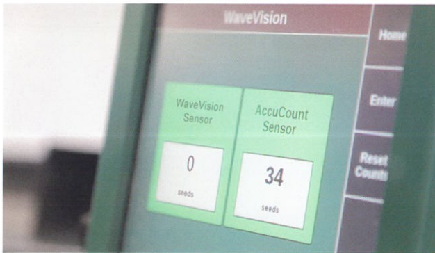
The WaveVision sensor isn't fooled by the dust like the optical sensor is. See the difference in what these two sensors report to the 20/20 SeedSense®.